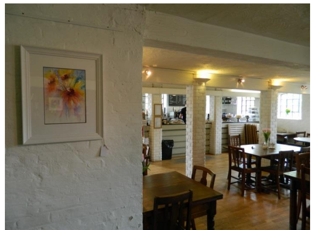
Sue Colyer- Contemporary Watercolours