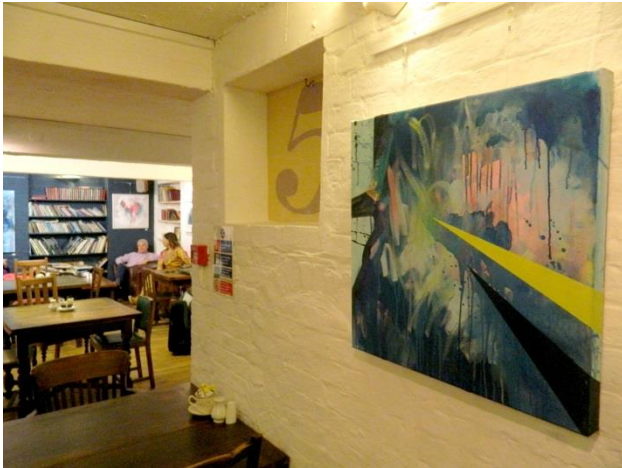
Charlie Betts – Series 2