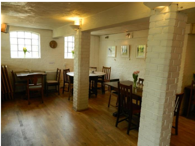
Sue Colyer- Contemporary Watercolours