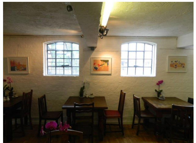
UCA Graduate Showcase, Naomi Cant-Barros – Salad Days